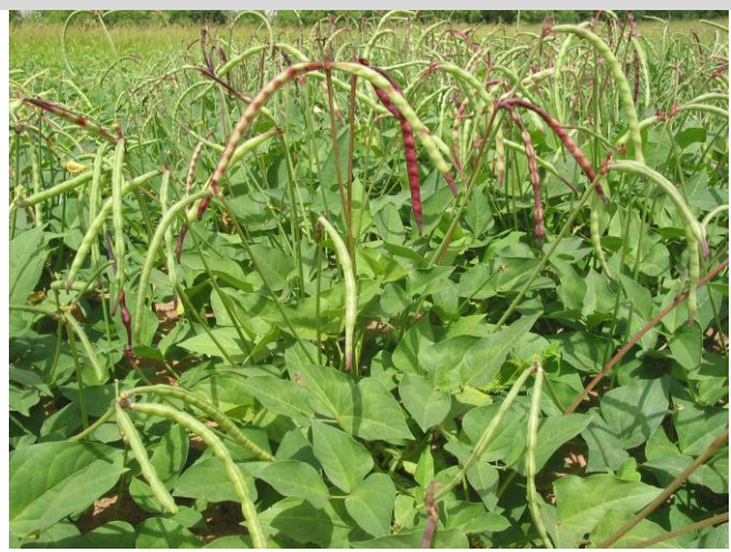
Cowpeas growing in a farmer's field in Senegal

This brief summarizes the results of an adoption survey conducted in 2010 to assess the impact of cowpea research and seed system development efforts in three main cowpea growing regions in Senegal: Diourbel, Thiès, and Louga. Results from this survey and past impact studies are used to derive the estimates of cowpea varietal adoption over time and the gains in yield from the adoption of improved varieties. An economic surplus modeling approach is used to estimate aggregate benefits from the adoption of improved varieties. These benefits are then compared to the costs of research on cowpea improvement and variety dissemination to derive rate-of-return estimates on these investments.